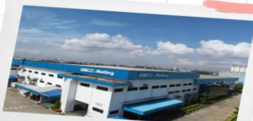
GMCC & WELLING (THAILAND)